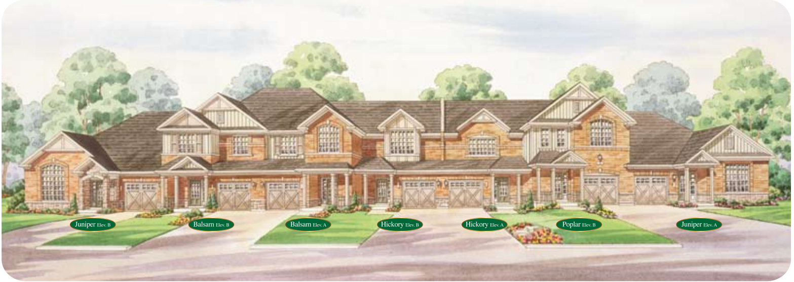
Juniper Elev. B