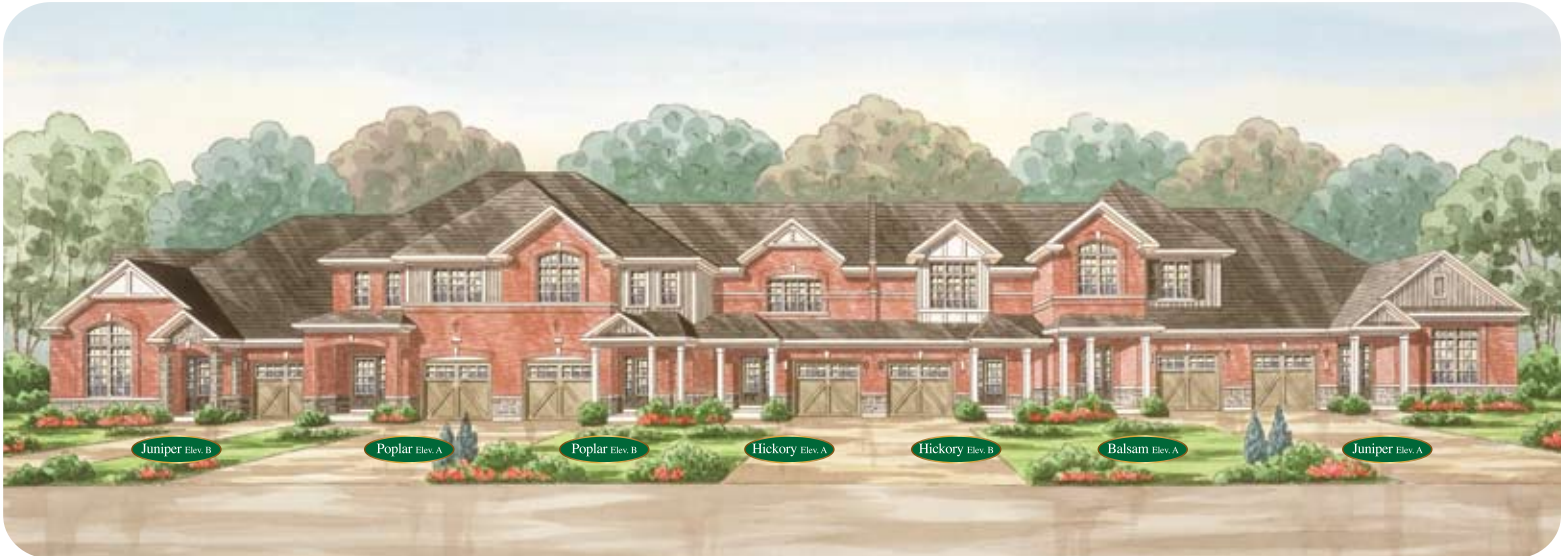
Juniper Elev. B